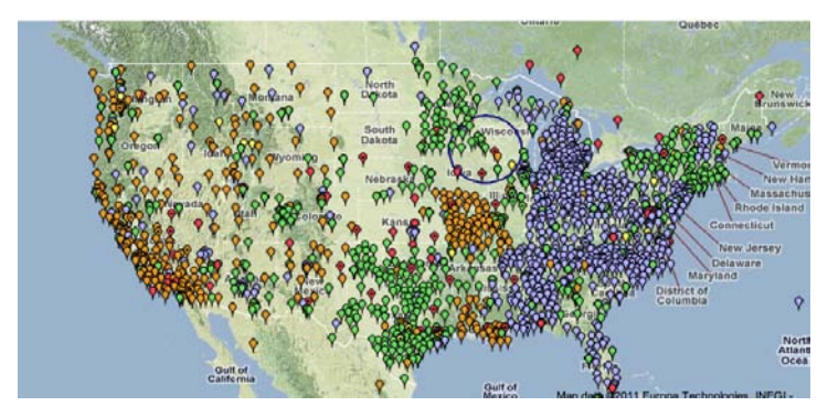
Figure 3. U.S. CORS Station Locations

High-precision receivers are also used in many state and local networks. The National Geodetic Survey (NGS), an office of NOAA's National Ocean Service, manages a network of Continuously Operating Reference Stations (CORS) that provide Global Navigation Satellite System (GNSS) data consisting of carrier phase and code range measurements in support of three dimensional positioning, meteorology, space weather, and geophysical applications throughout the United States, its territories, and a few foreign countries. The sites are independently owned and operated. Each agency shares their data with NGS and NGS in turn analyzes and distributes the data free of charge. As of May 2010, the CORS network contains over 1,450 stations, contributed by over 200 different organizations, and the network continues to expand (See Error! Reference source not found. ).