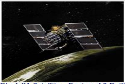
Block IIA Satellite – Designed & Buil by Rockwell International