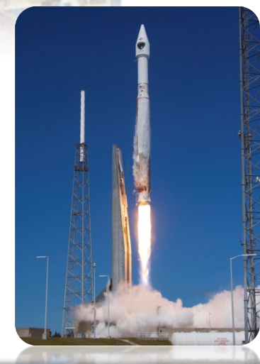
29 Oct: IIF-8