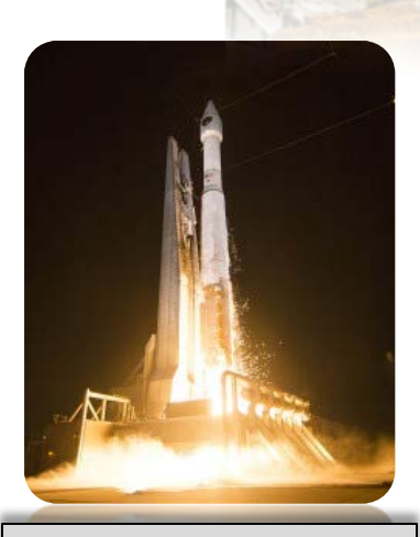
1 Aug: IIF-7