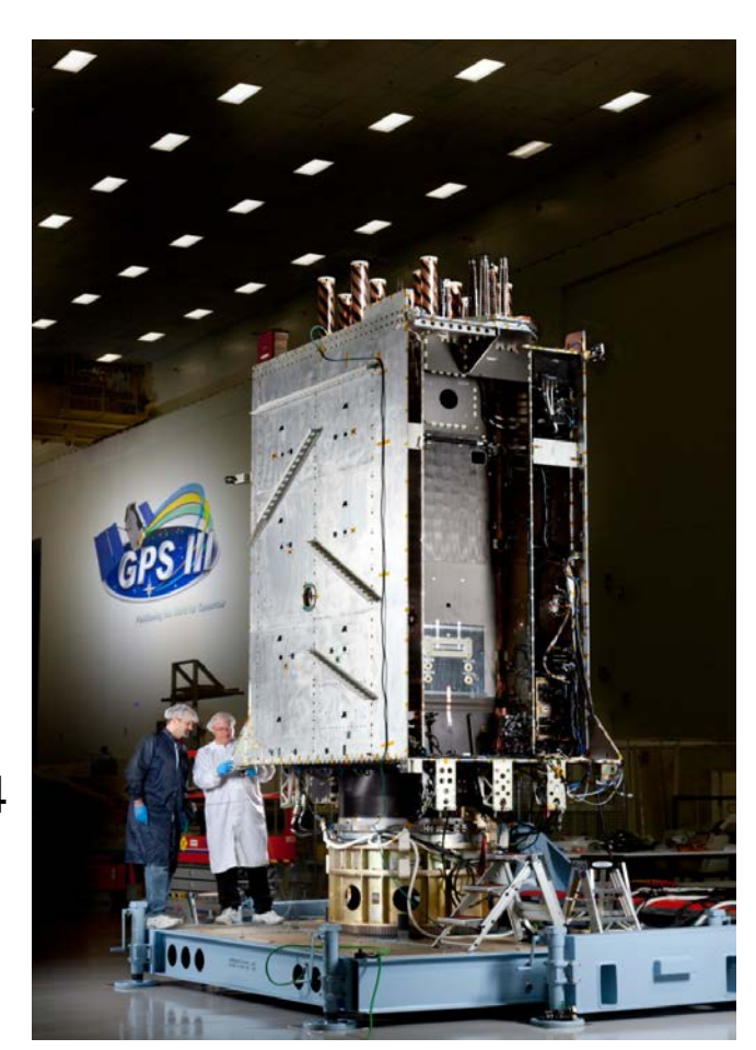
Lockheed-Martin (Waterton, CO) - Prime