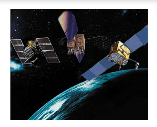
39 Satellites / 30 Set Healthy Baseline Constellation: 24 Satellites