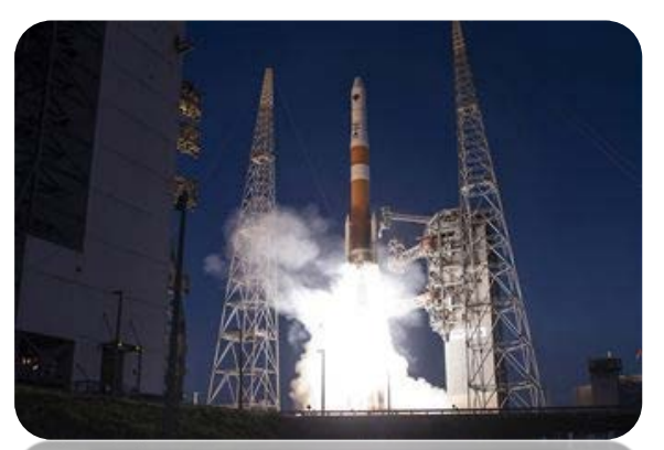
16 May: IIF-6