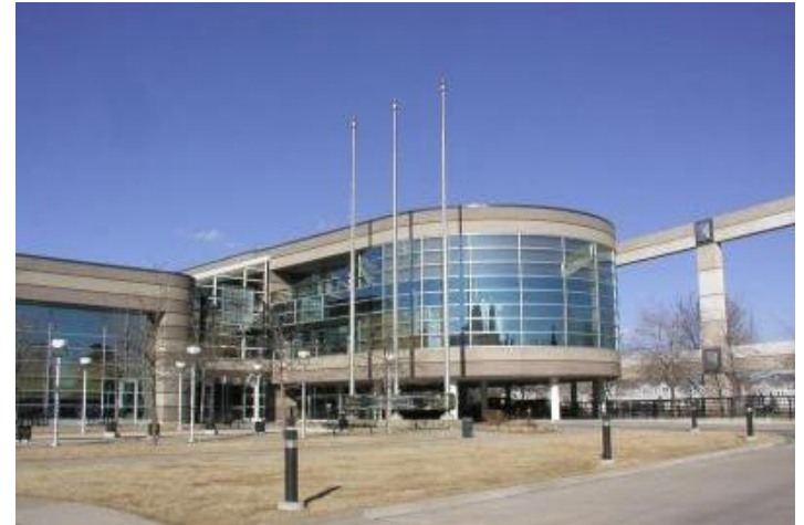
UCAR Center Green Facility