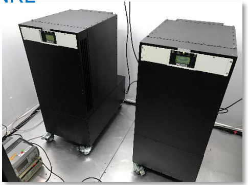
Commercial Active Hydrogen Masers