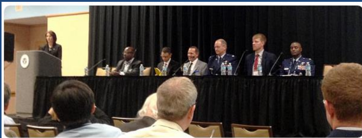
Image from the 55 th CGSIC Tampa, FL 2015

At the Institute of Navigation GNSS+ 2016 Conference Oregon Convention Center Portland, Oregon September 12-13, 2016