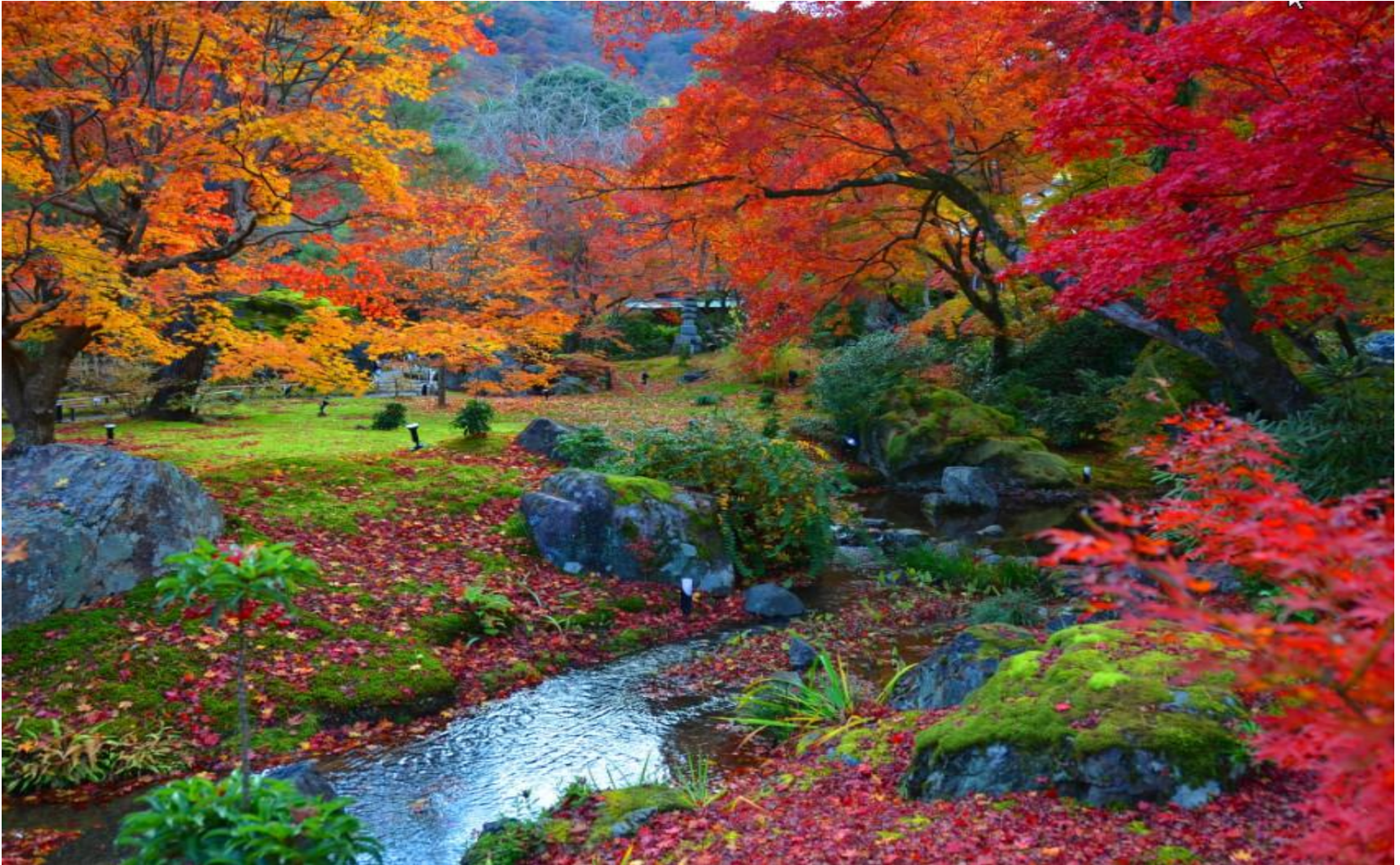
The Garden at Hogon-in Temple (宝厳院)