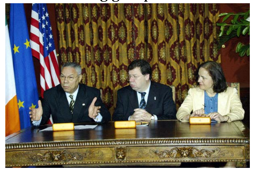
June 26, 2004, press conference at U.S.-EU Summit in Ireland (U.S. Sec. of State Colin Powell, Irish Foreign Minister Brian Cowen, EU Vice-President Loyola De Palacio)