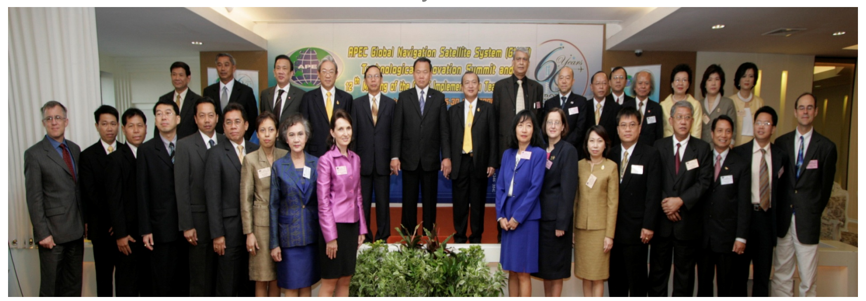
GNSS Technological Innovation Summit, Bangkok, May 2008